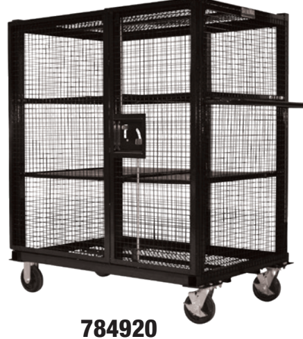
STOR MAC<sup>™</sup> 48